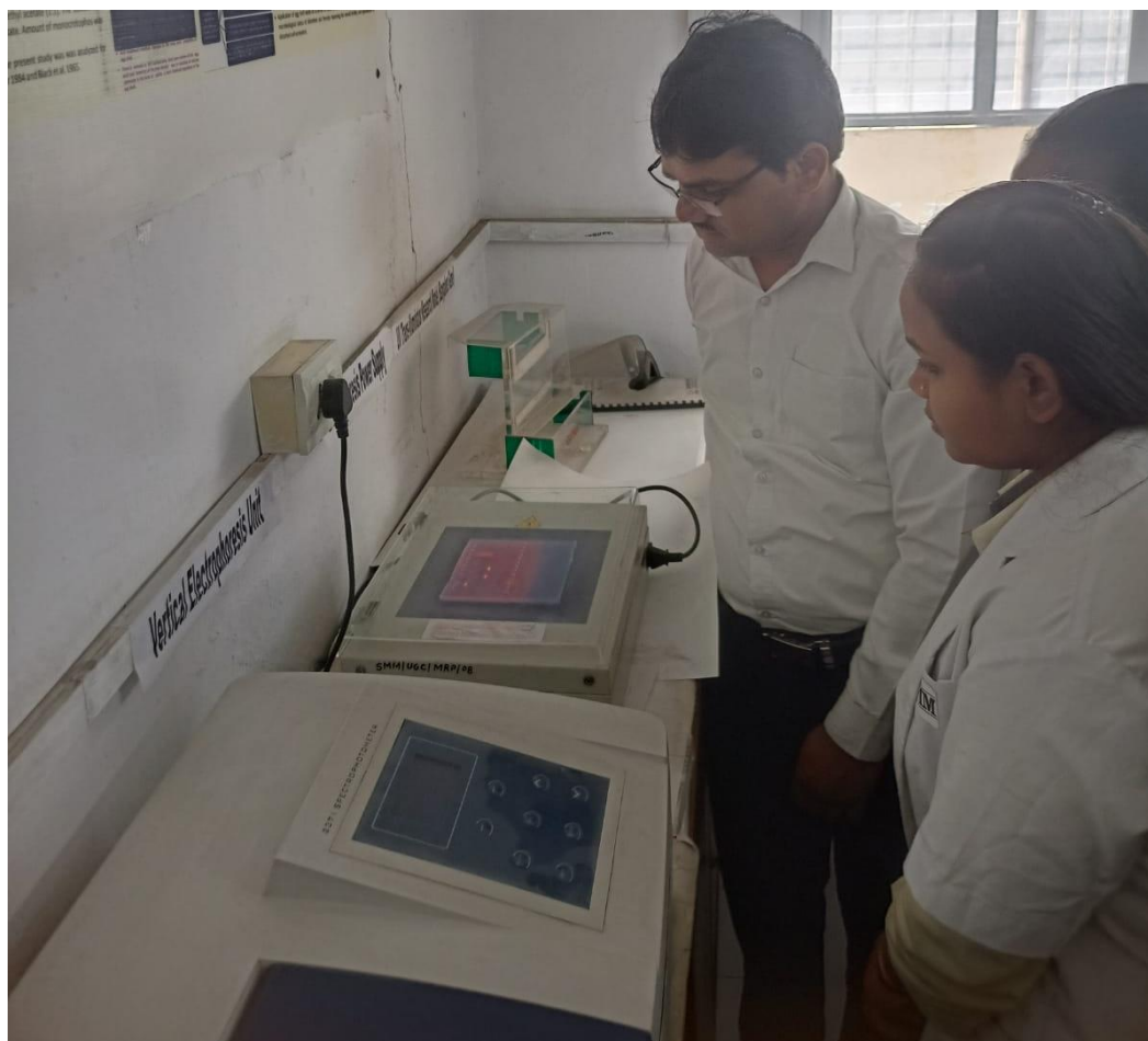
Students visualizing the Plasmid DNA on UV Transilluminator