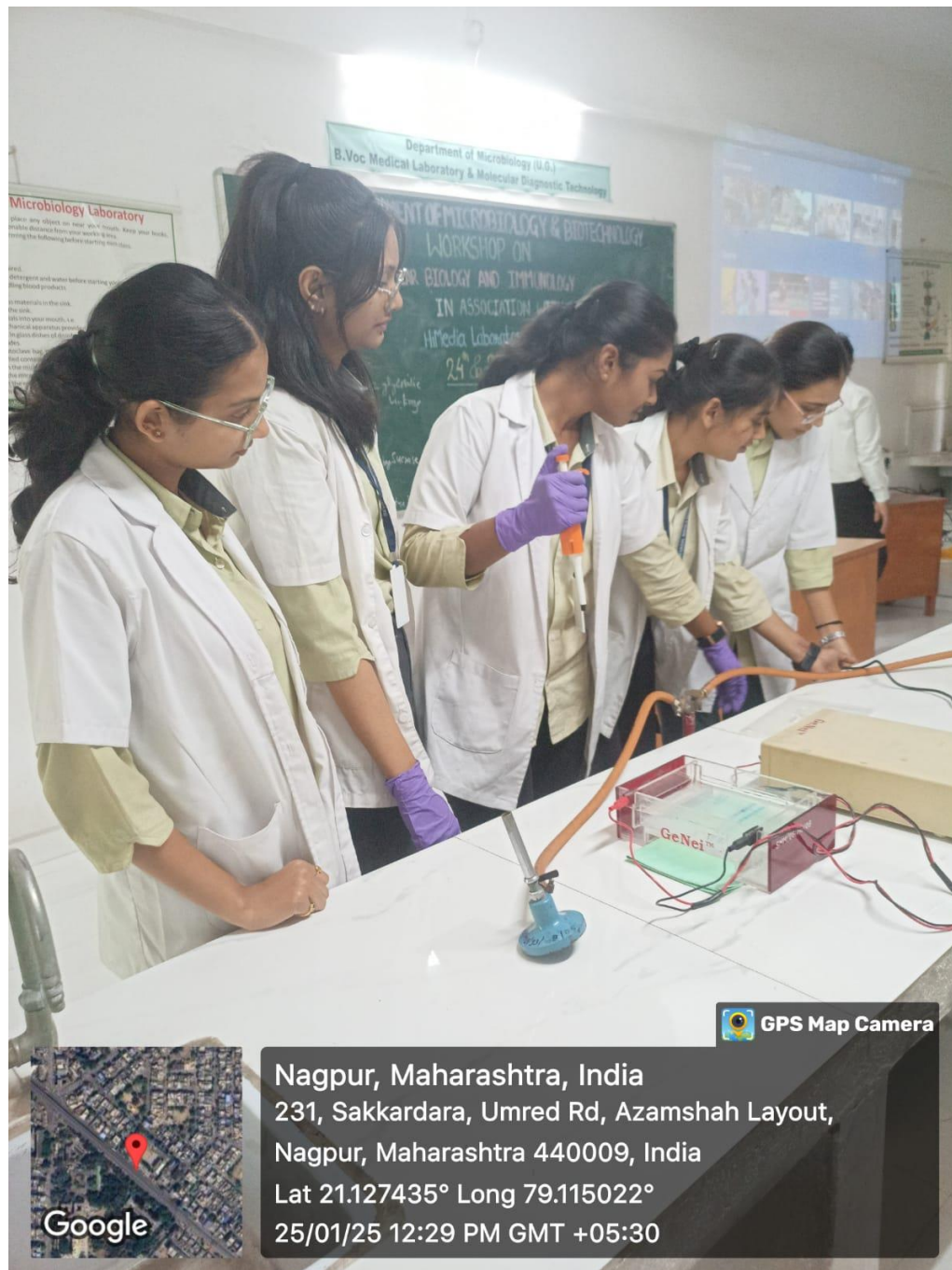
Students performing experiments of Molecular biology