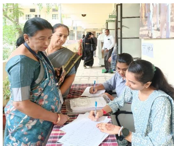
Registrations counter for health check-up camp for society.